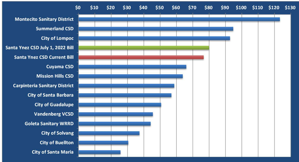
Chart ES-1 Comparison of Single-family Residential Monthly Wastewater Bills For Rates in Effect February 2021

Note: Above table uses wastewater rates in effect February 2021. Chart does not include any other charges than those published on each agency’s website. City of Lompoc uses 10 HCF of winter water use. District’s July 2022 bill is based on the wastewater service charges in Table 10.